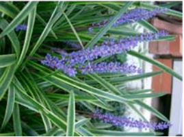
Lilipe muscari Lily Turf