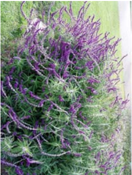
Salvia leucantha Mexican Bush Sage