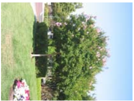
Lagerstroemia 'Muskogee' Lavender Crape Myrtle