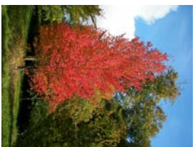
Acer rubrum 'Columar' Red Maple