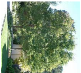
Pyrus c. 'Aristocat' Aristocat Pear