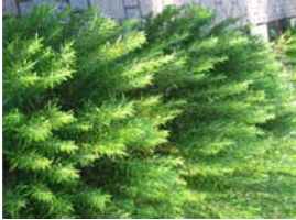
Rosmarinus officianalis Rosemary