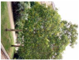
Tristania laurina Water Gum