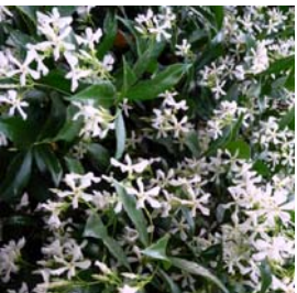
Trachelospermum jasminoides Star Jasmine