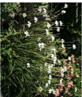
Diets iridoides Fortnight Lily