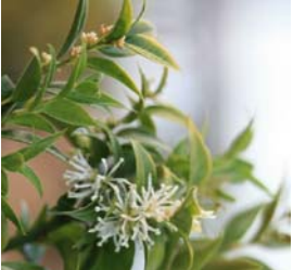
Sarcococca ruscifolia Sweet Box