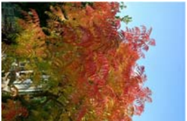
Pistacia chinensis Chinese Pistache