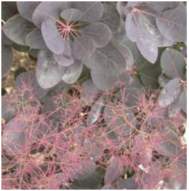
Cotinus coggygria Smoke Tree