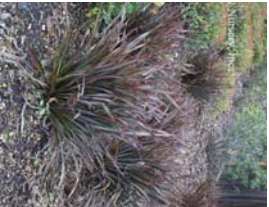
Phornium t. 'Jack Spratt' Dwarf New Zealand Flax