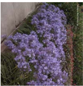
Agapanthus 'Peter Pan' Lily of the Nile