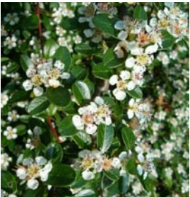
Coloheaster d. 'Lowfast' Bearberry Coloheaster