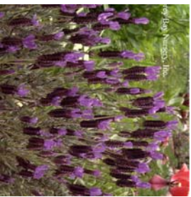
Lavandula s. 'Oto Quast' Spanish Lavender