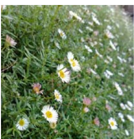
Eigeron karvinskianus Santa Barbara Daisy